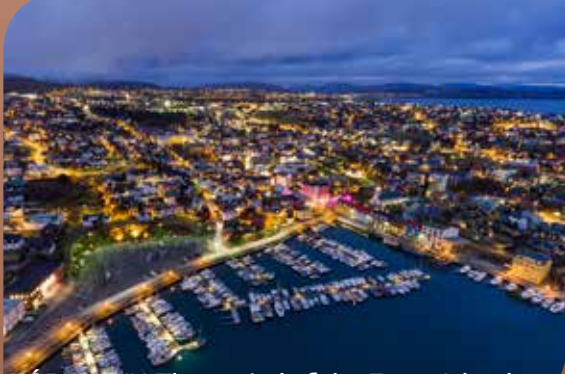
TÓRSHAVN The capital of the Faroe Islands